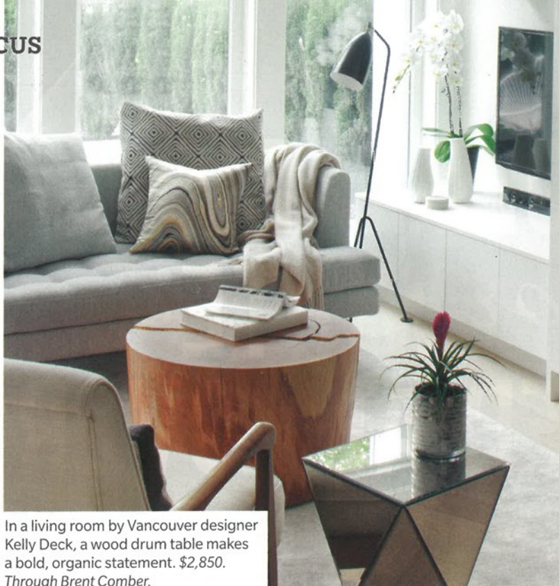
In a living room by Vancouver designer Kelly Deck, a wood drum table makes a bold, organic statement. $2,850. Through Brent Comber.